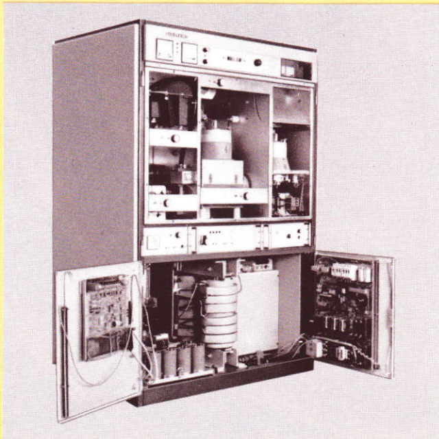
5 kW Medium Wave Broadcast Transmitter